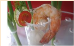
Tequila lime shrimp