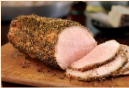
Roasted pork loin