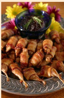
Cornish hen wrapped in bacon: Cornish hen leg wrapped in jalapeno pepper bacon.