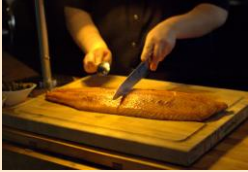
Fresh salmon filet