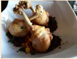
Chicken lollipops: wing section bone in chicken lollipops.