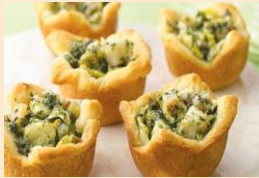
Chicken Tartlets: spinach and chicken served on a pastry tart