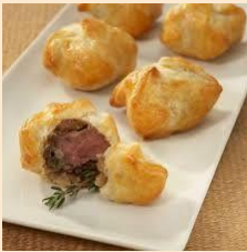
Kobe beef wellington: Kobe beef tender loin seared then covered with mushroom pate then wrapped in pastry