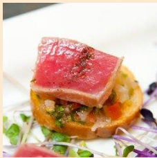
Shaved ahi tuna with marinated white bean Bruschetta