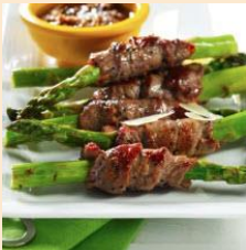
Asparagus wrapped in beef tenderloin: white and green asparagus wrapped in beef tenderloin