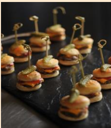
Petite Bison Sliders: our quarter size slider with bison meat.