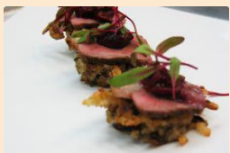
Duck on wild rice pancakes: Duck breast seared and sliced on top of a wild rice pancake.