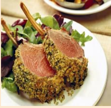
Mini lamb lollipops: Slow roasted New Zealand lamb chop “Lollipops”