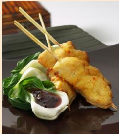
Mustard chicken skewers: Dijon mustard marinated chicken tender cook on the oven