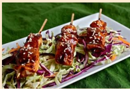
BBQ Asian chicken: chicken tender braised on Thai BBQ sauce and finish on the grill