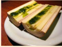
Blue crab stuffed hearts of palm with avocado "butter"