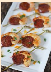
Our grilled shrimp served on a stick with a round of chorizo