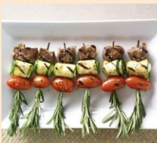
Lamb cubes skewer on rosemary sticks: paired with mozzarella, cheese cherry tomato, and a cube of zucchini