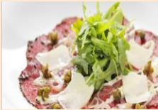
Beef Carpaccio: beef tenderloin shaved and cooked on our sauce paired with parmesan cheese and pickle jalapenos