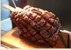
Steam Ship Round